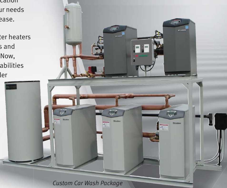
Custom Car Wash Package Heating boilers for wash bay de-icing and water heaters for wash equipment.

For years Lochinvar has been packaging water heaters with tanks in order to ease installation costs and complexity of domestic hot water systems. Now, Lochinvar is taking their proven custom capabilities to the next level with custom, pre-piped boiler packaged systems.