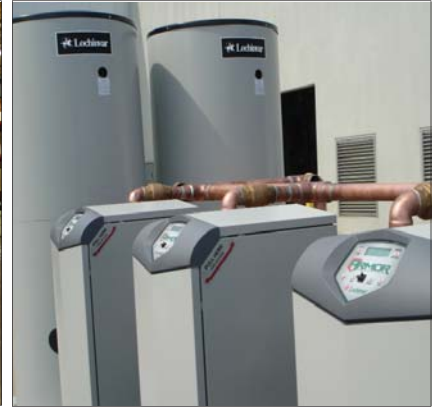
Three (3) AWN399PM with Two (2) RJA200 Storage Tanks