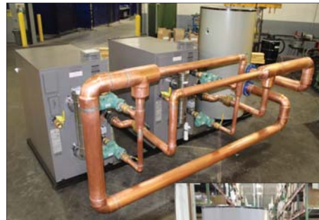
Two (2) SBN1500 with one (1) RVU 300 Buffer Tank

For more information about custom packaged solutions from Lochinvar, please contact your local Sales Representative or Lochinvar Customer Service at 615-889-8900 or visit www.lochinvar.com .