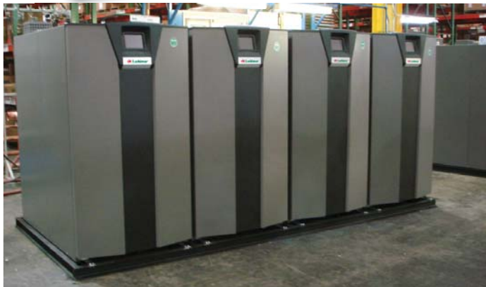
Four (4) SYNC Boilers with common manifolds

Before an order is placed, Lochinvar will provide 3-dimensional CAD renderings for customer approval before ordering.