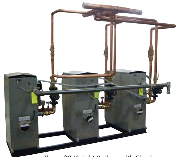
Three (3) Knight Boilers with Single Point Gas Connection