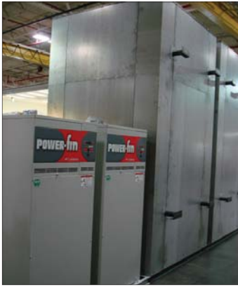
Two (2) PFN1501PM with two (2) Square Jacketed Storage Tanks