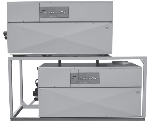
Two Lochinvar 990,000 Btu/hr Copper-Fin2 pool heaters stacked for a total capacity of almost 2 million Btu/hr.

Lochinvar’s Stack Frame is fully factory assembled and shipped in one piece. The frame is welded using square steel tubing by certified welders ensuring integrity for the life of the frame.