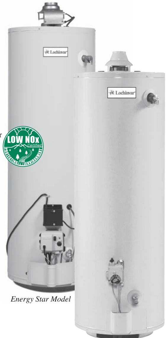
Energy Star Model

*1-year limited tank & parts warranty when installed in a commercial application.